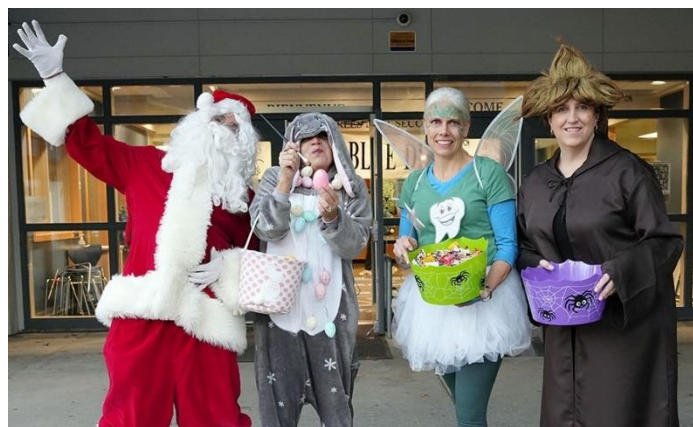
“The Guardians” aka our Administration