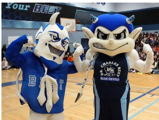
Blue Devil then and now