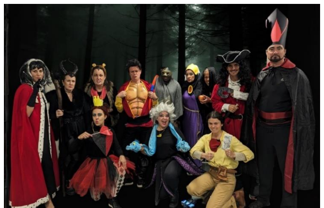
“Evil Disney” aka our Languages Department