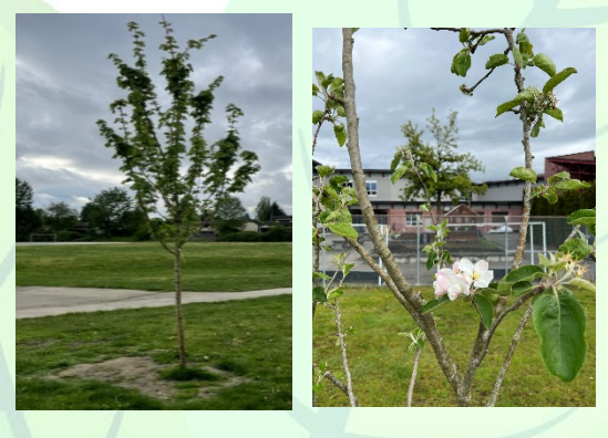
Above: Blossoming Trees at Kilmer and Terry Fox