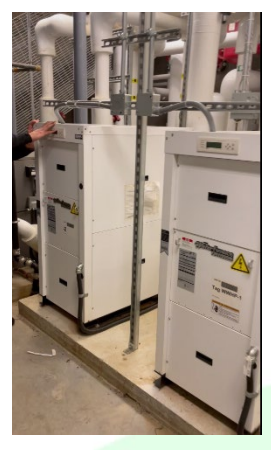
WATER SOURCE HEAT PUMPS