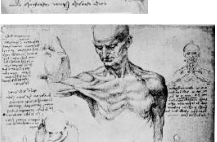
Visual Narrative: Study for "Last Supper"