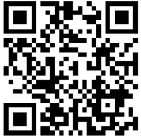
"Your Digital Footprint May Be Unflattering" Video