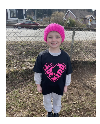
Many students wore "Be Kind" shirts & other pink gear!