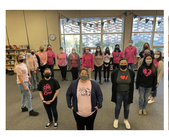
Moody Elementary Staff modeling big hearts and many shades of pink!