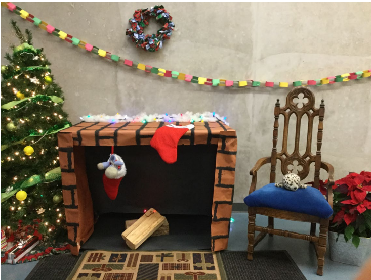
Muffin the emotional support donkey (Div 13) and Alonzo the seal (Div 14)