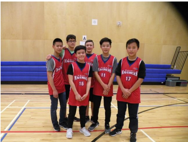
Some members of our Grade 7 & 8 boys volleyball teams, at the District Finals