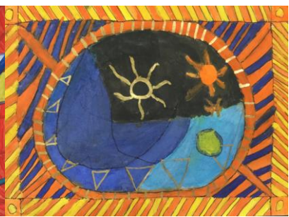
Wing Hei L