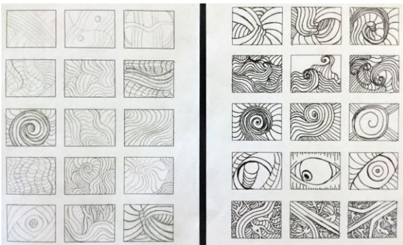
Brooklyn F (drawing)