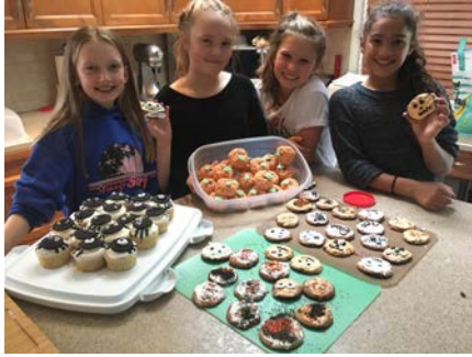
Our students preparing for our WE bake sale!

A Huge thank you to everyone who baked, donated and took part in this annual event!