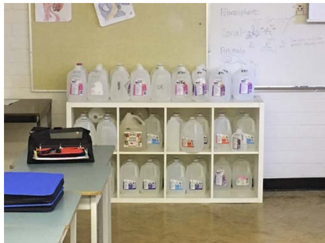
A familiar sight in classrooms throughout all pods at EMMSOTA

If you have not yet signed up for SchoolCashOnline, please register as soon as possible – click here: https://sd43.schoolcashionline.com/ Then click on 'GET STARTED TODAY'