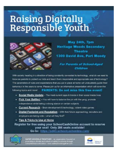
Raising Digitally Responsible Youth May 24 @ Heritage Woods