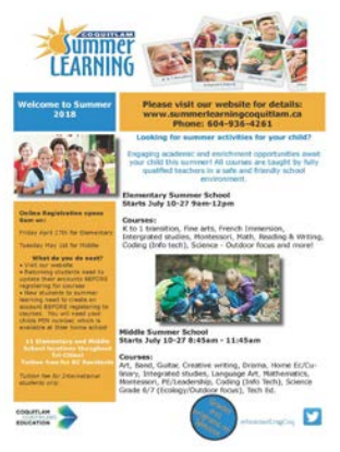
SD43 Middle Summer School