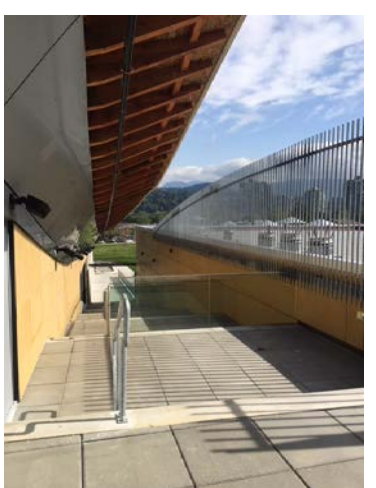
Flexible Outdoor learning spaces

Please discuss your after-school plans and procedures with your child so there are no surprises. Recently we have had calls that students are not getting home at the expected time, or they are planning to stay at school for extended periods of time without being part of a planned after school event. Please help us reduce the amount of unsupervised time for your son/daughter after school to support their socially responsible choices and positive use of time.