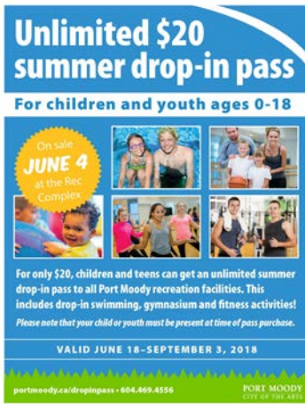
2018 Port Moody Summer Pass on sale June 4