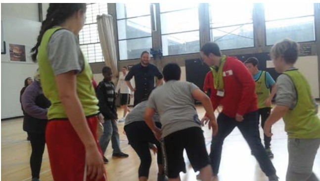
photo of SFU field trip 2017

A reminder to parents to return the permission form for this year's field trip to the SFU Burnaby campus on Thursday, April 26 th ... Please remember to mark the date in your calendars! As in the past years, we hope that the field trip will be a success and the students will enjoy the workshops, the activities, and the snacks prepared for them. We are looking forward to a fun-filled day of learning at SFU!