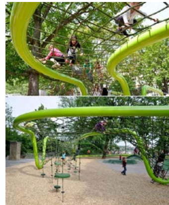
(sample playground photo)