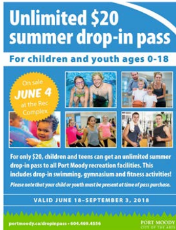
2018 Port Moody Summer Pass on sale June 4