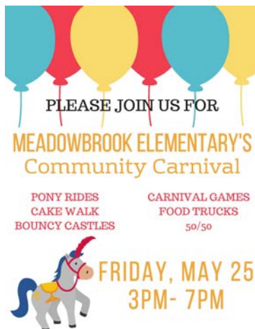
Meadowbrook Community Carnival