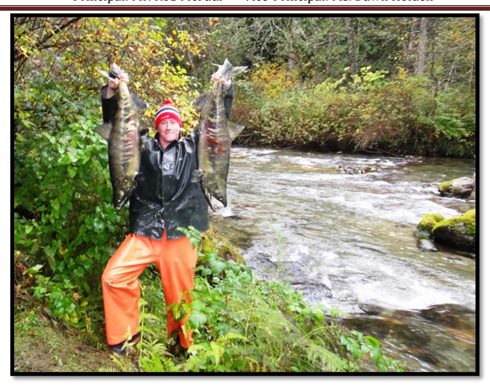
Friday, May 23 7- 9:30PM, Centennial School, 570 Poirier, Coquitlam