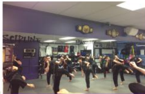
Martial Arts for Men, Women, and Teens