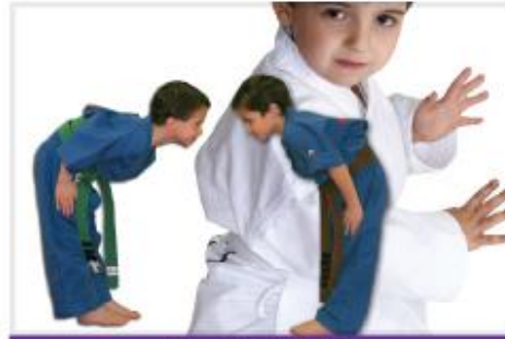
Martial Arts For Kids Age 3+