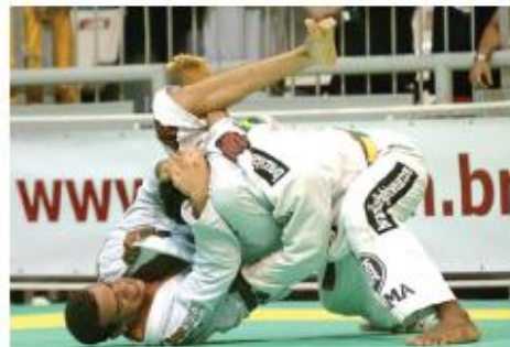
Brazilian Jiu-jitsu Programs for Kids, Teens, and Adults