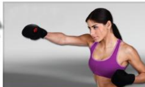
Cardio Kickboxing for Men, Women, and Teens