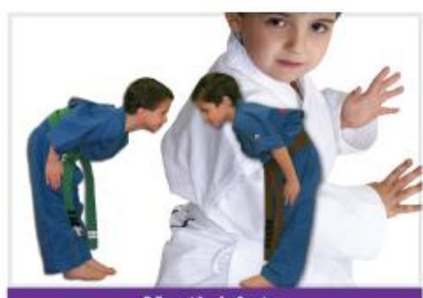
Martial Arts For Kids Age 3+

please email or call us to schedule your first trial class info@coquitlammartialarts.com or call 604-351-1551 109 - 2922 Glen Dr. Coquitlam