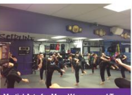
Martial Arts for Men, Women, and Teens