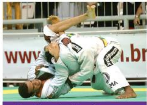
Brazilian Jiu-jitsu Programs for Kids, Teens, and Adults