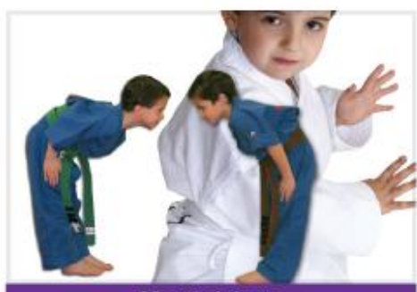
Martial Arts For Kids Age 3+