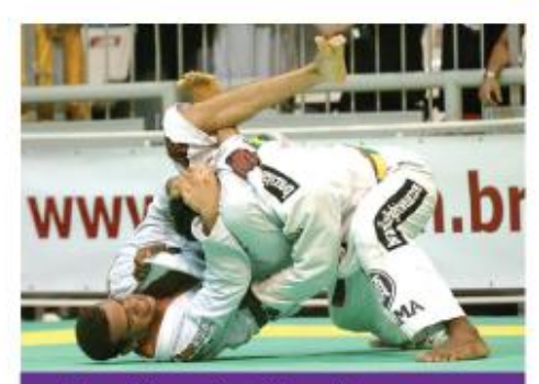
Brazilian Jiu-jitsu Programs for Kids, Teens, and Adults