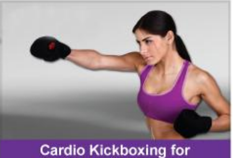
Cardio Kickboxing for Men, Women, and Teens