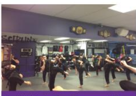
Martial Arts for Men, Women, and Teens