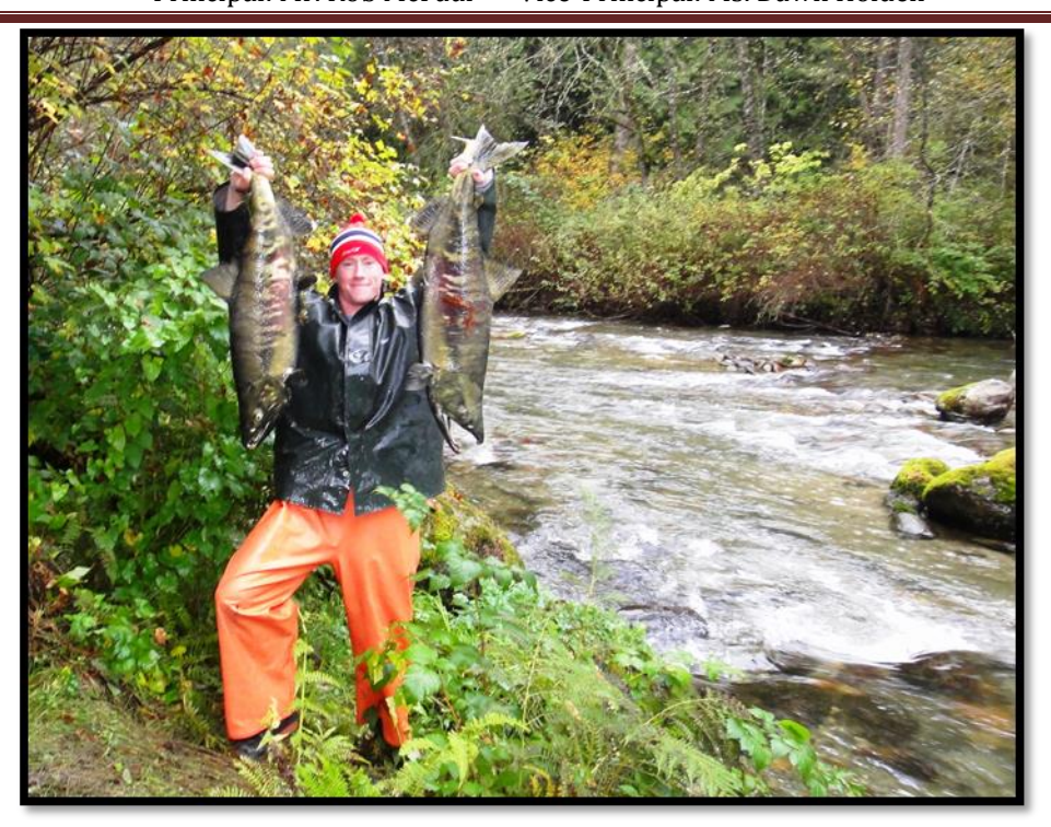
Friday, May 23 7- 9:30PM, Centennial School, 570 Poirier, Coquitlam