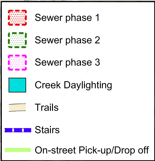
ROCHESTER PARK - Construction Activity - August to November 2015