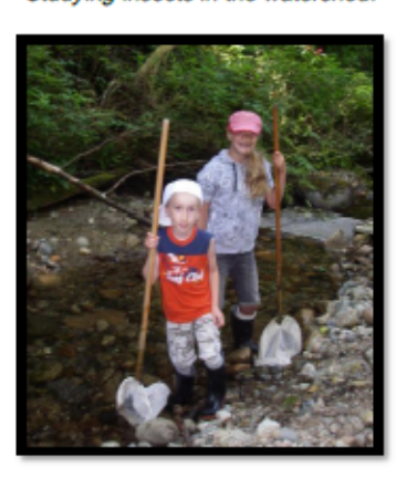
Collecting aquatic insect samples.