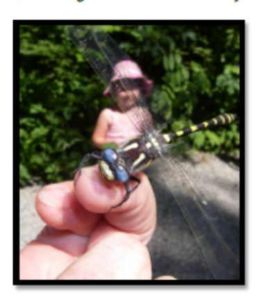
Studying insects in the watershed.