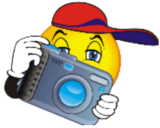
PHOTO RETAKES- Tuesday, October 29 th

Photo order forms & instructions went home yesterday. All orders are to be submitted online by October 14 th , or returned to the office by 9am on Tuesday, October 15 th . The photographer will be back on Tuesday, October 29 th for those students who would wish to have a retake or who have missed the opportunity to be photographed on September 17 th .