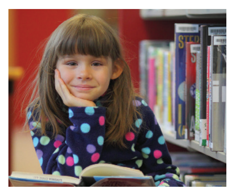
Cross Catchment Application Process 2020–2021

Cross Catchment Application and Kindergarten Registration for the 2020-2021 school year starting in September 2020 occurs soon. Read the school and program registration information below for more details.