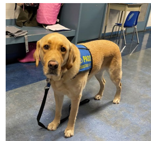
Tommy, the PADS Dog from Pitt River even stopped by to lend a paw!

If you need to be in touch with an administrator, please do not hesitate to call the Kilmer Office at 604-941-3401 or email kilmer@sd43.bc.ca