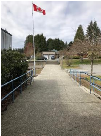
One last look...