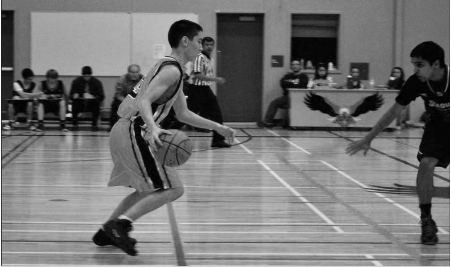
Dominating the court: Battling a Seaquam Seahawk, grade 12, controls play as he moves up court past his check. Gleneagle will be hosting a mustsee tournament from December 14 to 16.