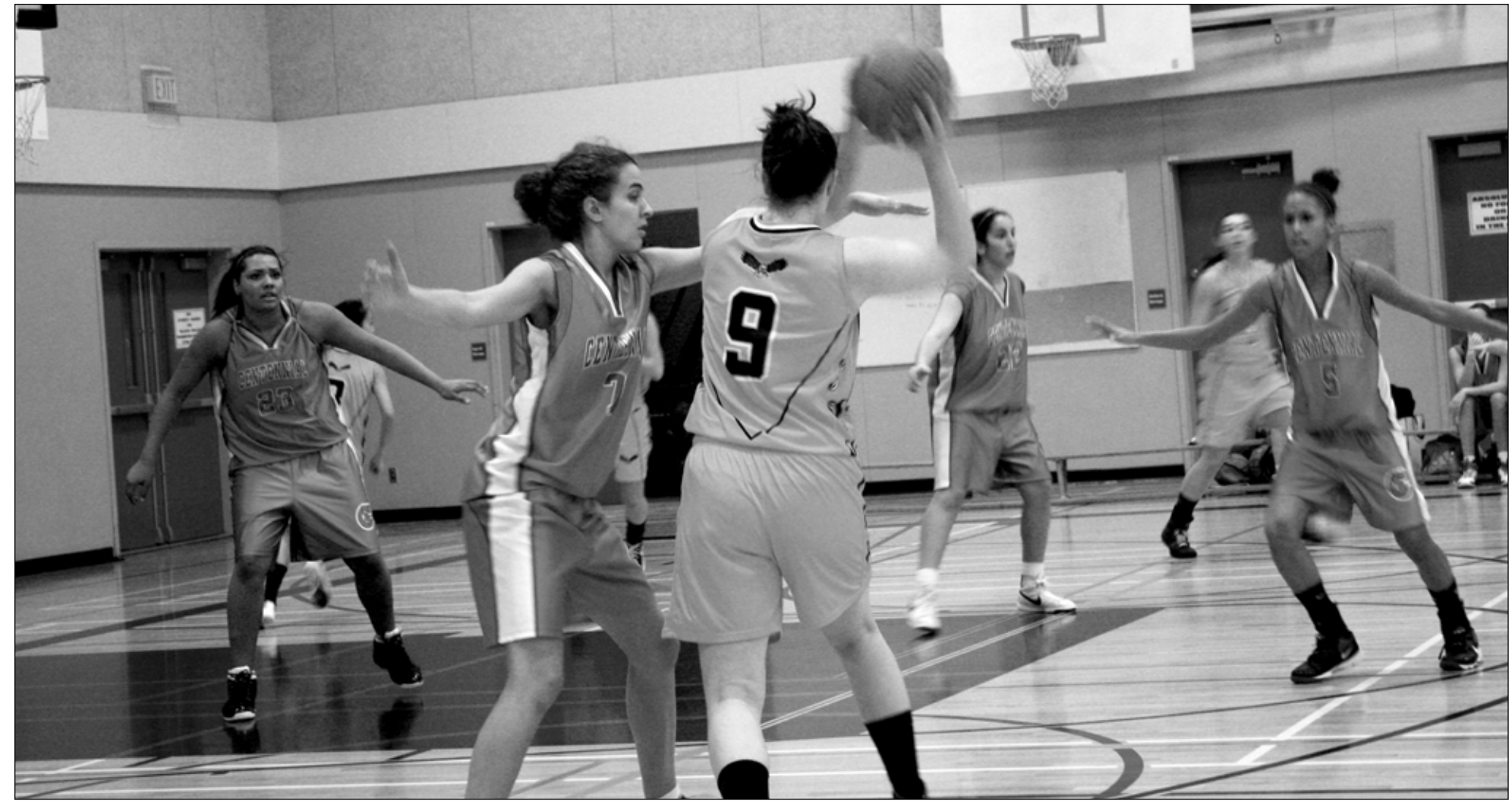
The best defence is a good offence: Monday night saw another victory against Centennial for the senior girls as they head into Riverside's Tournament for Emily, where the province's top teams are competing until tomorrow. The team continues to build momentum with a season record of eight and two.