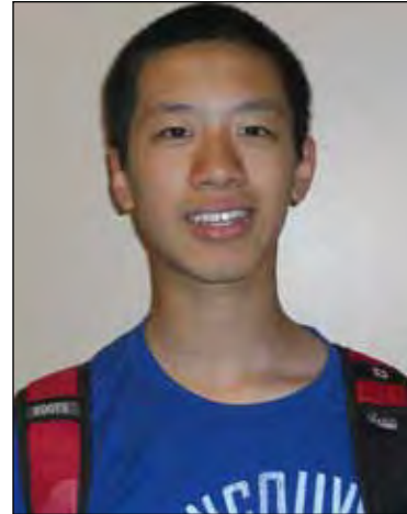
Grade 11 "Having my pants pulled down"