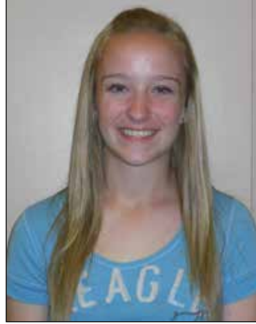
Grade 10 "Tripping in the front entrance"