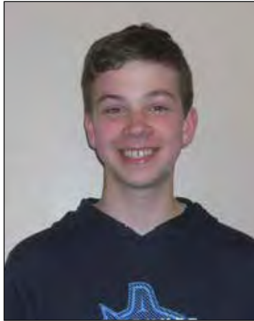
Grade 9 "Thinking it was pyjama day"