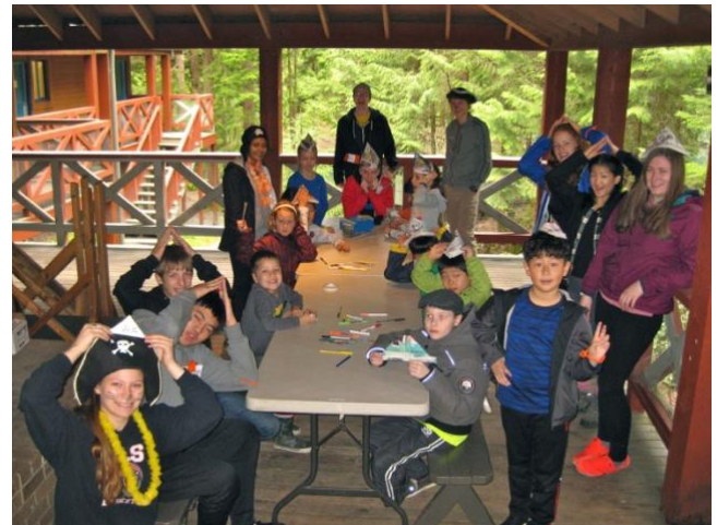
2018 April Day Camp weekend