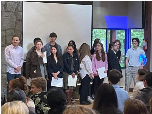
2022 Leadership Graduation Night

Graduates of Leadership Two often carry their skills onto post-secondary education, part-time jobs in leadership positions in their communities, or even seasonal employment with Sasamat Outdoor Centre. After two years of playing and learning with their peer cohort, Leadership Two students often graduate the program having formed a special community of long-lasting friendships.