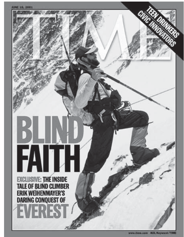
Time Magazine, June 18, 2001

the rock face of Yosemite’s El Capitan, the icefall of Polar Circus in the Canadian Rockies and—upon returning from Everest—the fibreglass Matterhorn at Disneyland.