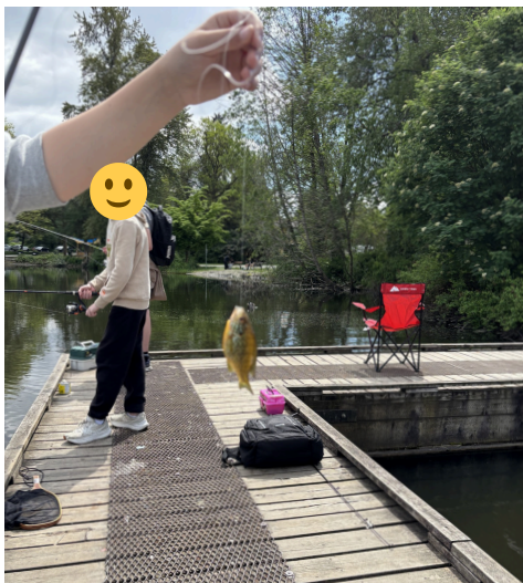
Yesterday was our first day of Genius Hour and students participating in the Fishing activity at Como Lake caught 10 fish! Fish were released back into Como Lake.

For groups that are going off site (swimming/weightlifting, Mountain Biking, Fishing and Skateboarding, please complete the permission form on School Cash Online today! There is no cost to students as our fundraising was able to cover costs.