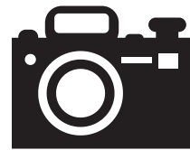
PHOTO RE-TAKE DAY

This year there is no sign up for retakes. All students that were absent from the original photo day will be on the photographers list and will have a photo QR sheet to take home with them the same as on original photo day. Anyone who wishes to have a retake photo taken may do so. Vibrant Photos will not be issuing a second student ID card to those students that have retakes taken; however, only the absent students will receive them.