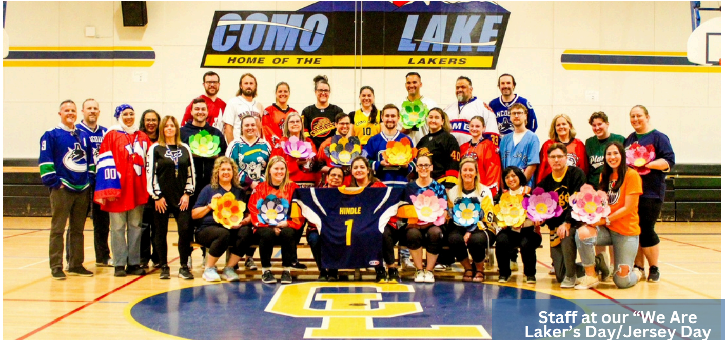
Staff at our "We Are Laker's Day/ Jersey Day"