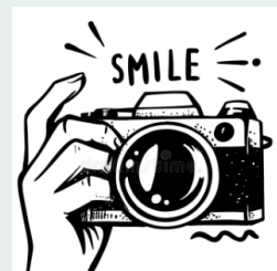
PHOTO RE-TAKES ARE WEDNESDAY NOVEMBER 6TH

PLEASE ALWAYS ADVISE THE OFFICE IN ADVANCE WHEN YOUR CHILD WILL BE ABSENT OR HAS TO LEAVE THE SCHOOL EARLY BY LOGGING AN ABSENCE OR EARLY DISMISSAL USING THE ABSENCE REPORT ON OUR SCHOOL WEBSITE OR CALL THE OFFICE. THANK YOU.