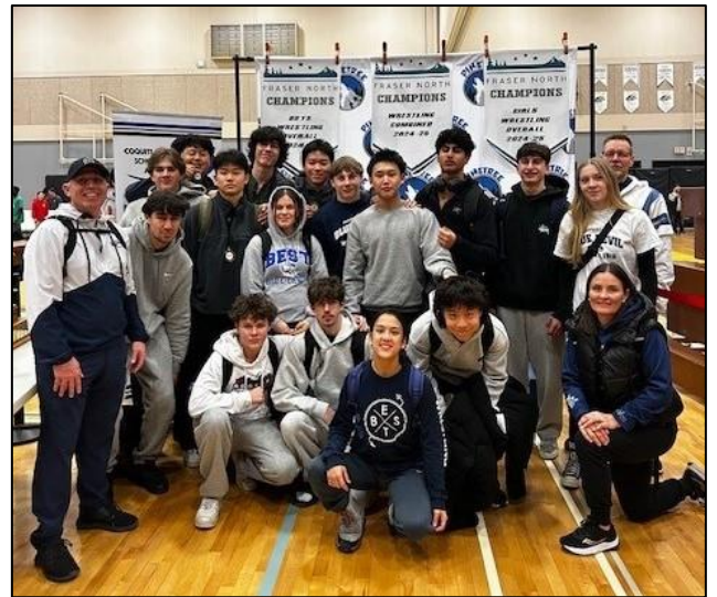
2024-2025 Wrestling Team and Coaches