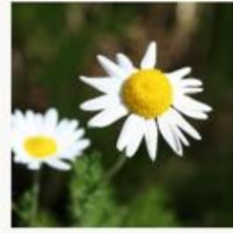
HR1057A - Organic German Chamomile

EARN 40% OF THE PACKET PRICE FOR EVERY SEED PACKET YOUR TEAM SELLS