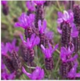
HR1093A - French Lavender