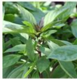
HR1018A - Siam Queen Thai Basil