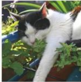
HR1049A - Catnip