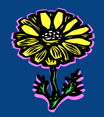
Learning the Voyage of Discovery