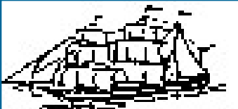
Learning the Voyage of Discovery