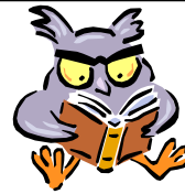
I love books!

"Reading aloud with children is known to be the single most important activity for building the knowledge and skills they will eventually require for learning to read."