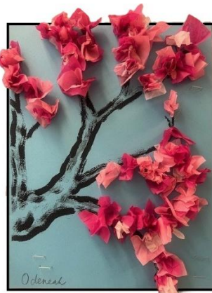
Odeneah, Div 4