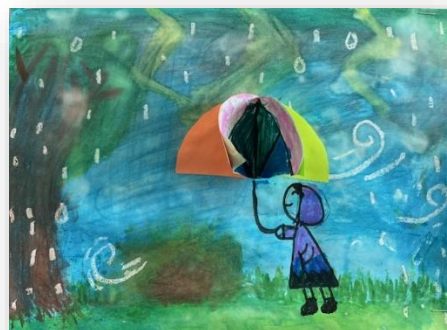
Lena, Div 6

Please make sure you have seen the hot lunch line-up for the remainder of the year!! Today was hot dog day but there are many more to come – order soon so that your child doesn't miss out!!