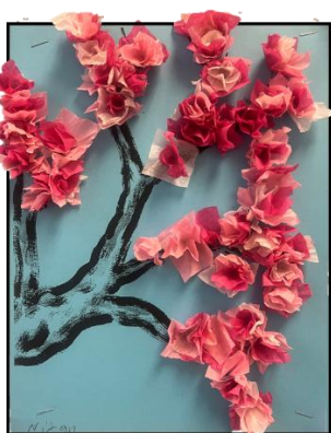
Nitan, Div 3

Please be aware that parents are always welcome to attend our school assemblies . They happen once a month and sometimes more if there is a special event. During our assemblies we talk about things that are happening school-wide, we spend time celebrating the learning that is that are happening in our classrooms, and we celebrate milestones like birthdays that happened during the month. We aim to make our assemblies a place to share and celebrate school experiences. The presentations are casual in nature and not meant to be performances.