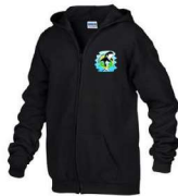
Gildan ® Heavy Zip Hooded Youth Sweatshirt