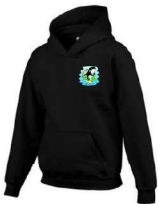
Gildan ® Heavy Hooded Youth Sweatshirt

Online Store Deadline: Tuesday October 31st, 2023 (11:59)