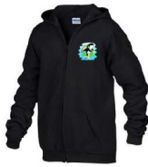
Gildan ® Heavy Zip Hooded Youth Sweatshirt