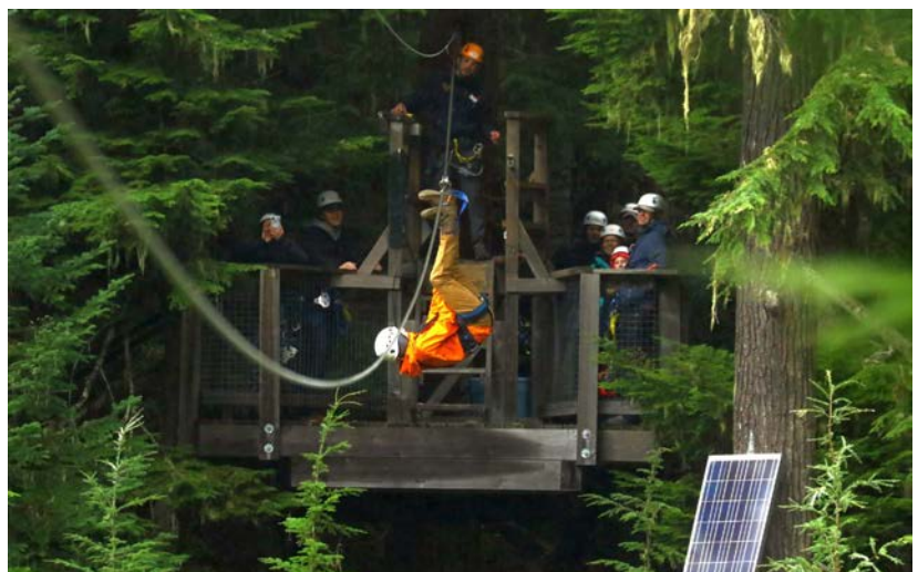
Outdoor Education fieldtrip: Ziplining in Whistler.