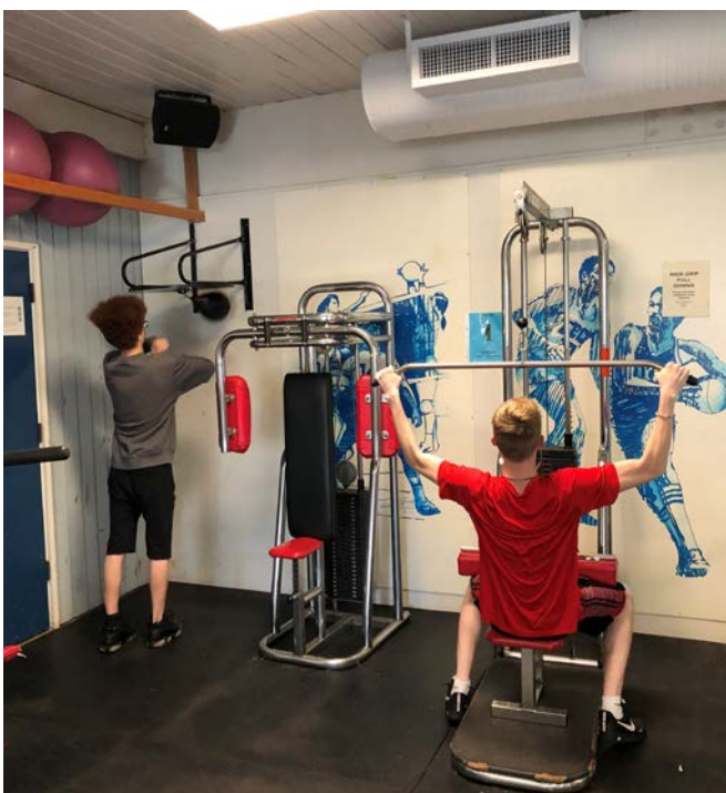
Students working out in Physical Education class.