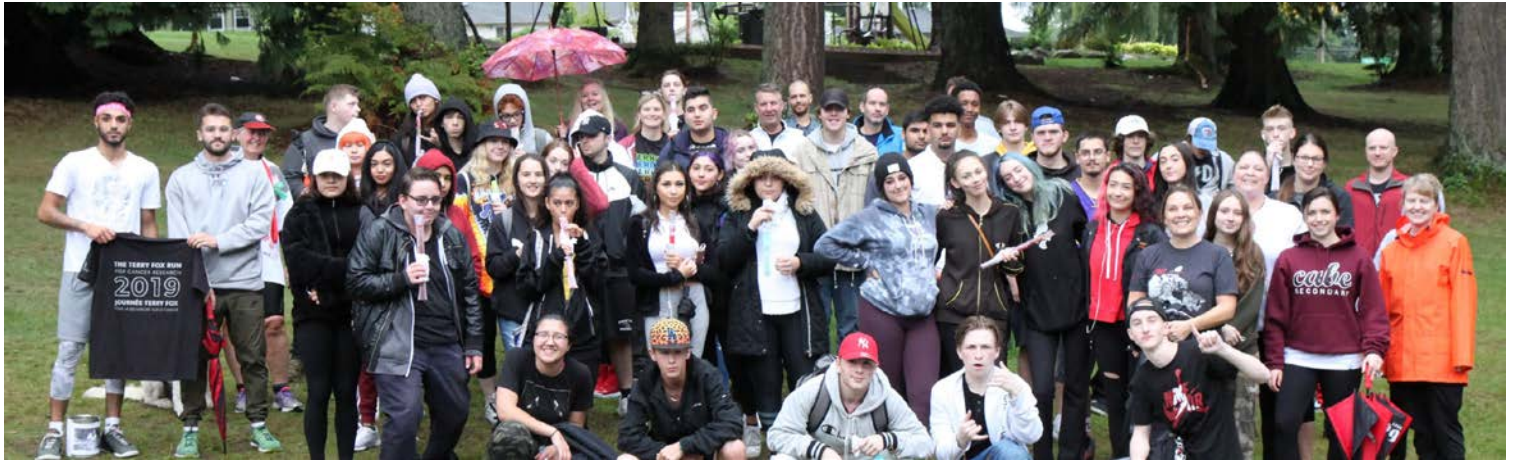
C/ABE/GOAL students and staff after the annual Terry Fox Run. Our school raised $372 for the Terry Fox Foundation.