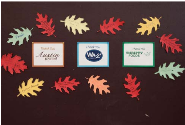
Thank you to our Thanksgiving Luncheon sponsors.