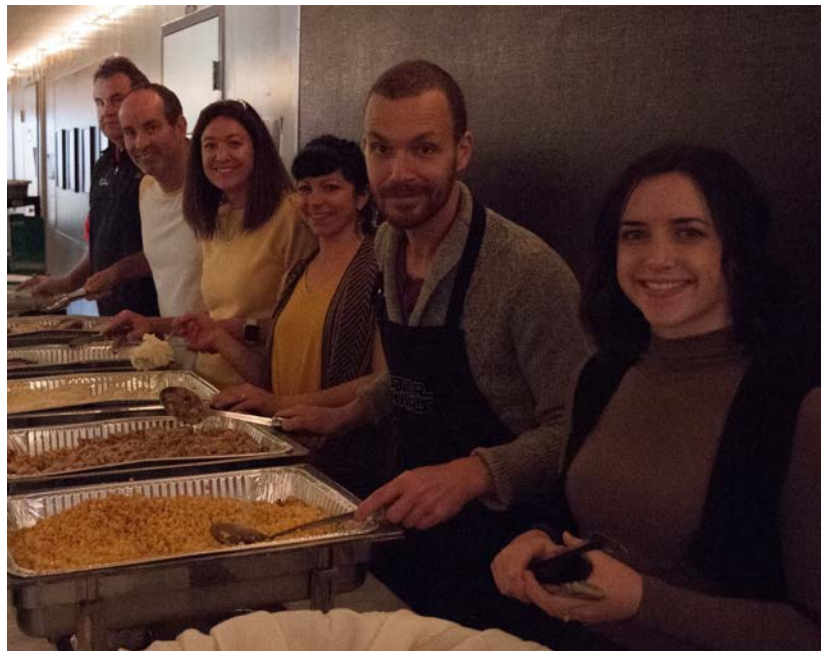
C/ABE staff preparing to serve Thanksgiving lunch to students.