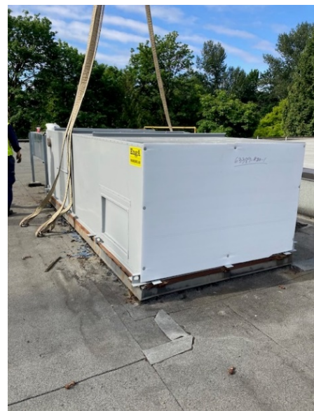
New RTU 1&2 (Maple Creek): New RTUs installed at Maple Creek Middle School.