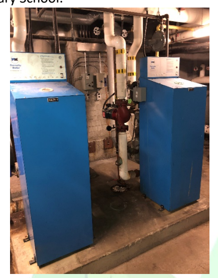
Before (Mid Efficient Boilers at Leigh Elementary)

The district has been working on improving mechanical heating systems in schools and is committed to reducing GHG Emissions. Recently, the district has replaced old inefficient boilers with new highly efficient condensing boilers at Leigh Elementary School, Central Community Elementary School, and Pleasantside Elementary School.