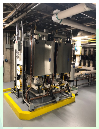
After (highly Efficient Condensing Boilers at Leigh Elementary)