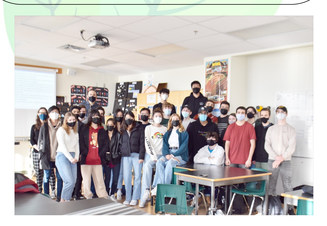
Heritage Woods Secondary School's Environment and Outdoors Club