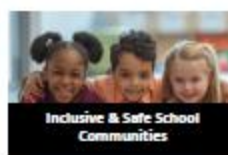
Inclusive & Safe School Communities