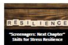
"Screenagers: Next Chapter" Skills for Stress Resilience