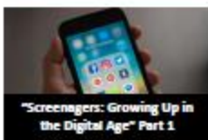
"Screenagers: Growing Up in the Digital Age" Part 1

Registration information for each session will be sent via email closer to each date. Sessions will be a mix of in-person, hybrid or virtual events.