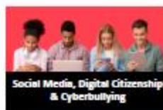
Social Media, Digital Citizenship & Cyberbullying