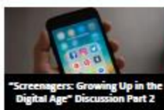
"Screenagers: Growing Up in the Digital Age" Discussion Part 2

Video Viewing Link Available January 18-31