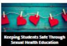
Keeping Students Safe Through Sexual Health Education