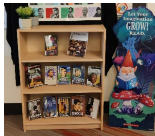
A display at the Eagle Mountain Middle School Learning Commons displaying information about famous Black Canadians and books by Black authors.