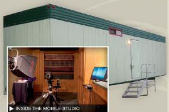
▶ INSIDE THE MOBILE STUDIO

REMEMBER , you must be photographed to appear in the yearbook and Graduation Composite.