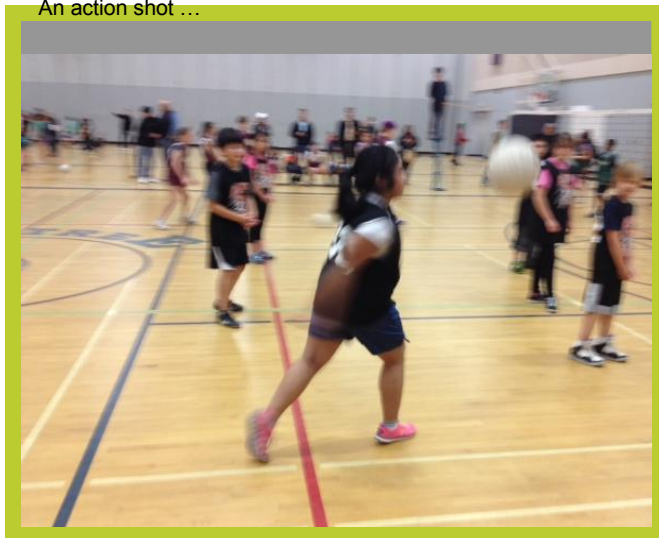
An action shot ...

Happy New Year to all Walton families! I trust that you have all enjoyed some wonderful quality time together over the past couple of weeks. With some rest myself and with batteries recharged, I look forward to a busy, productive and, as always, rewarding second half of the school year.