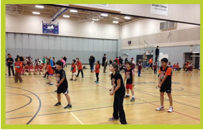
One of our grade 5 volleyball teams lined up during a volleyball match.