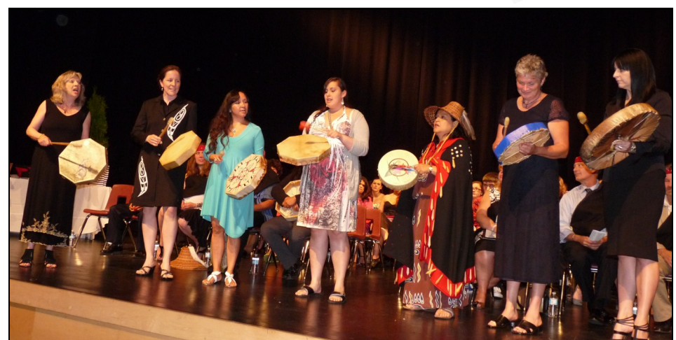
2011 First Annual Honouring Ceremony, Heritage Woods Secondary